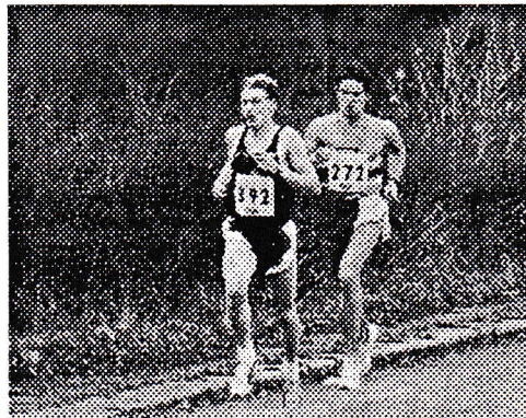
left- Don't Know What Youve Got till its gone!!

The second in series will be at the Green Bricks (properly called the Turners Arms) on Wednesday 10th December, off at 6.45 approx. It is intended at present to hold the series on the second Wednesdays if suitable, with the same venues as last year, although we have a variation in mind for the last event at Maltby. Past events, and common sense, concentrate our minds on maintaining safety at these events, which leads me to remind you that they are primarily for training and social purposes and can never be thoroughly marshalled. Helpers, who may be injured runners, are always helpful and it was heartening to see at the Woodman so many runners with white or reflective gear and running with proper regards to everyone's safety.