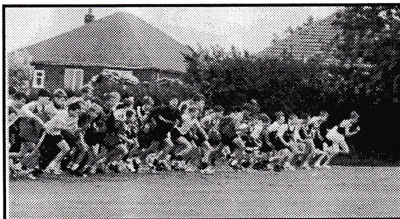
photo: start of the Rotherham Schools event at Dinnington