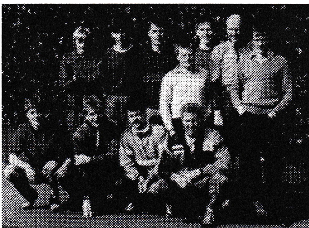
Who, where, what, when: and who is the missing man? Answers bottom of page 3

Of course we are well into the new series, with Ferriby, Snake Lane 10 and Norton 9 now gone. Next series races are Wombwell 5 and Doncaster Half with subsequent races yet to be decided but definitely including the road league series which starts on April 15th at Dinnington, Wakefield 10k on the 19th and Sheffield Half or Marathon or London on 26th (the first time we have included a "triple-header"!)